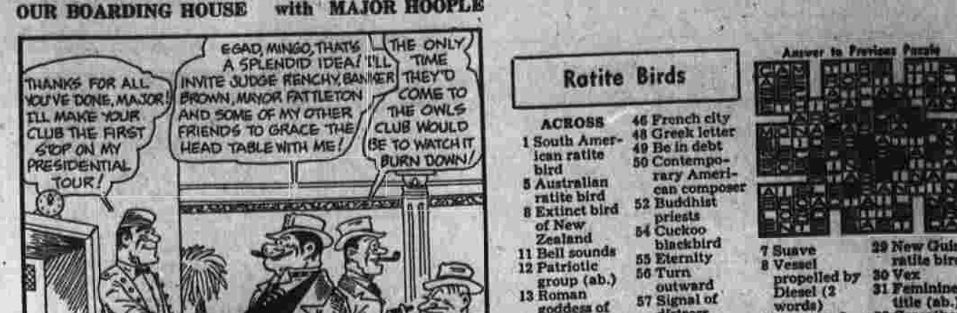
OUR BOARDING HOUSE with MAJOR HOOPLE